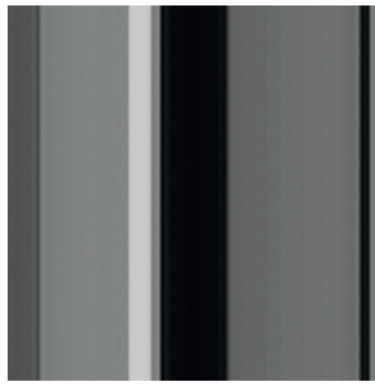
Black chrome finishing.