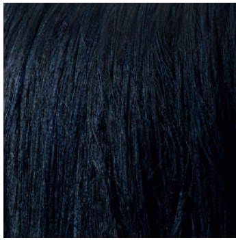
Black and Blue thin Cordonetto fringes in silk.