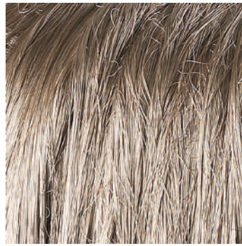
Champagne thin Cordonetto fringes in silk.