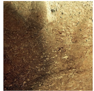
Acrylic Ochre coloration.