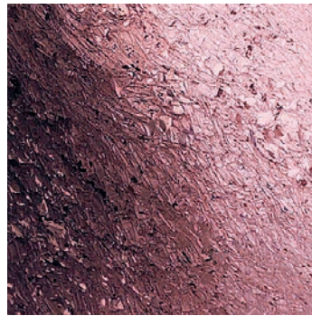
Acrylic Violet coloration.