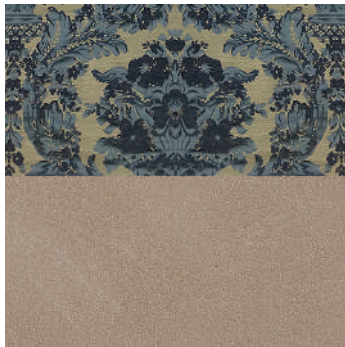
Beige aniline leather + Turquoise selected historical fabric.