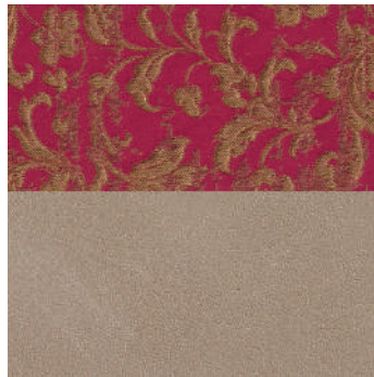
Beige aniline leather + Cardinal Red selected historical fabric.