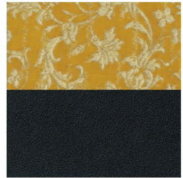
Black aniline leather + Gold selected historical fabric.