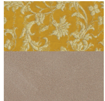
Beige aniline leather + Gold selected historical fabric.