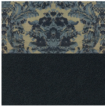
Black aniline leather + Turquoise selected historical fabric.