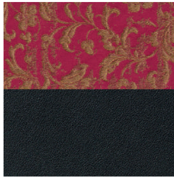
Black aniline leather + Cardinal Red selected historical fabric.